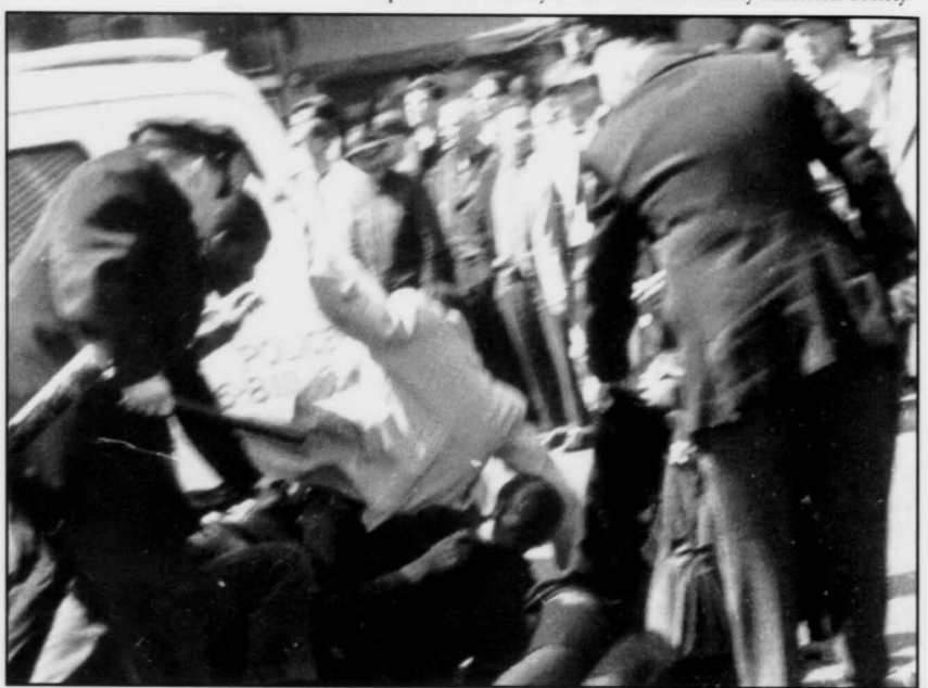
Police removing demonstrators blocking traffic in downtown Chester, March 1964