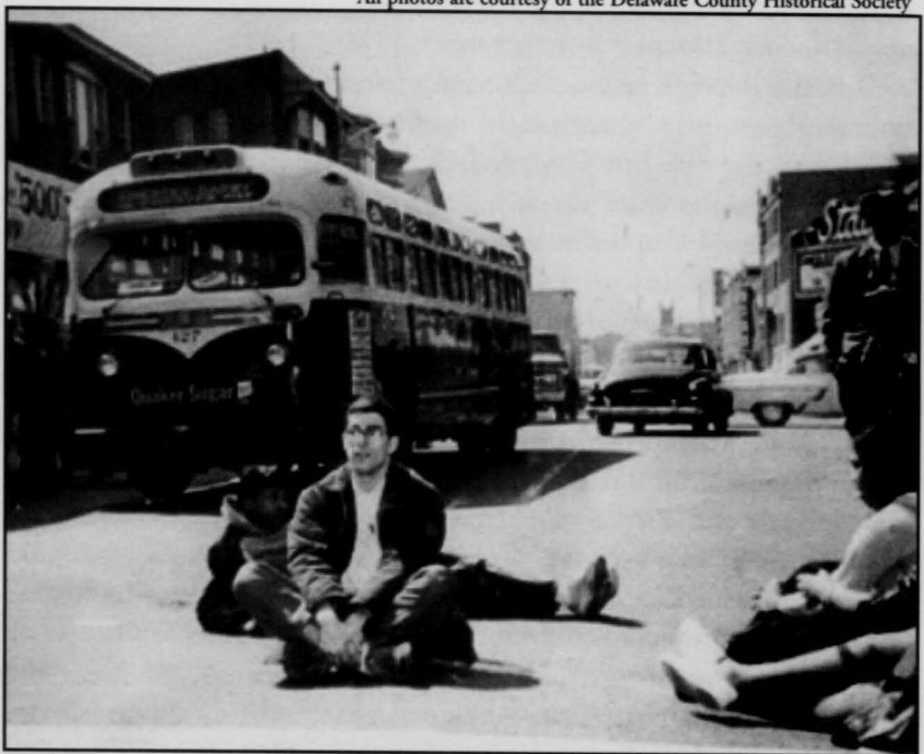
Street sit-in, Good Friday, March 1964