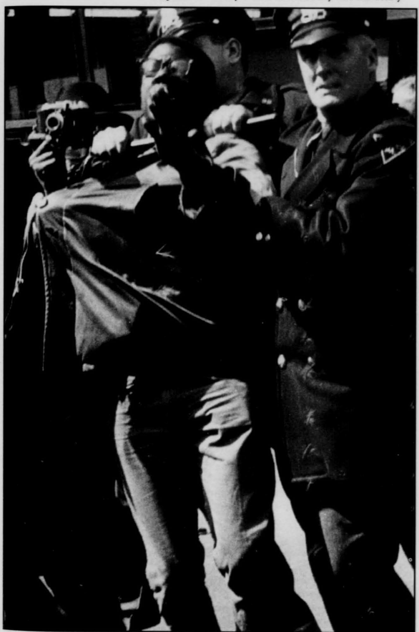
Police break up street sit-in, March 1964