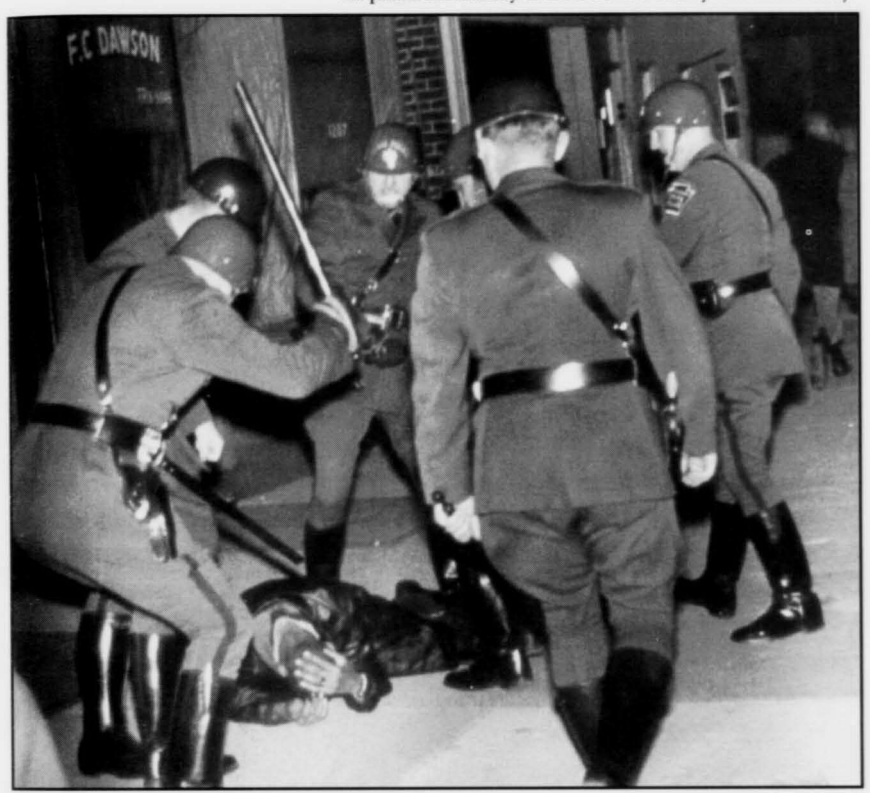
State Police subdue rioter at 3rd & Pennell Sts., April 1964

ing the total since March to nearly 600 and prompting numerous charges of police brutality. 137 "Troopers marched into the Negro slums," reported the New Republic , "and blackjacked every Negro in sight... They even clubbed a pregnant woman in the stomach." 138 Savage fled the chaos in the trunk of a car to avoid arrest. Branche labeled him a coward. 139 Following a 1:00 A.M. visit from a delegation of Chester ministers, Governor William Scranton rushed to Philadelphia and convinced Branche to obey a court-ordered moratorium on demon-