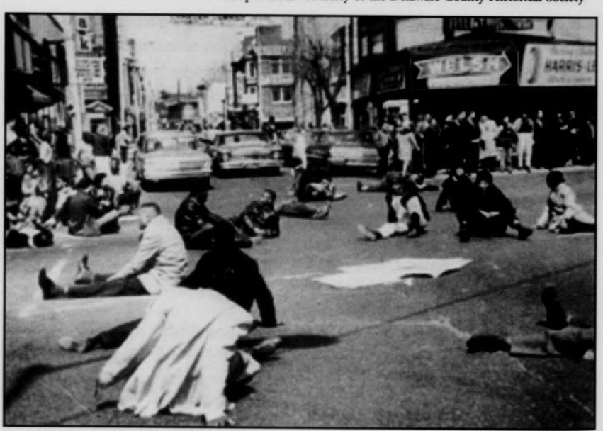
Street sit-in, Good Friday, March 1964