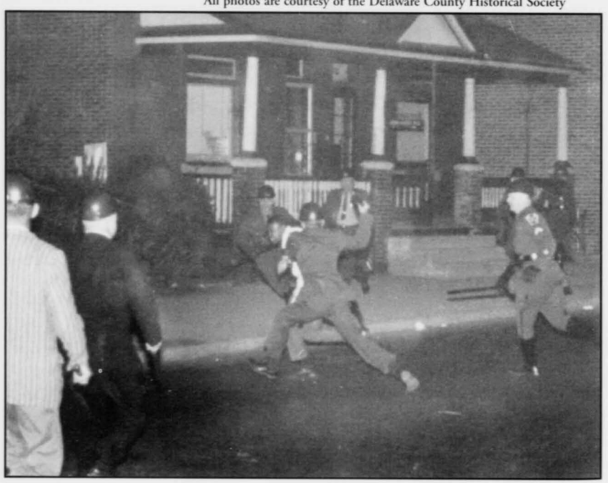
Rioters and police at 3rd & Pennell Sts., April 1964